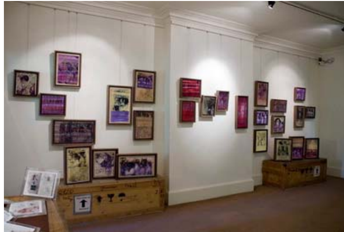
Figure 11. Installation of Bracha L. Ettinger paintings in Resonance, Overlay, Interweave , Freud Museum, London, 2009.