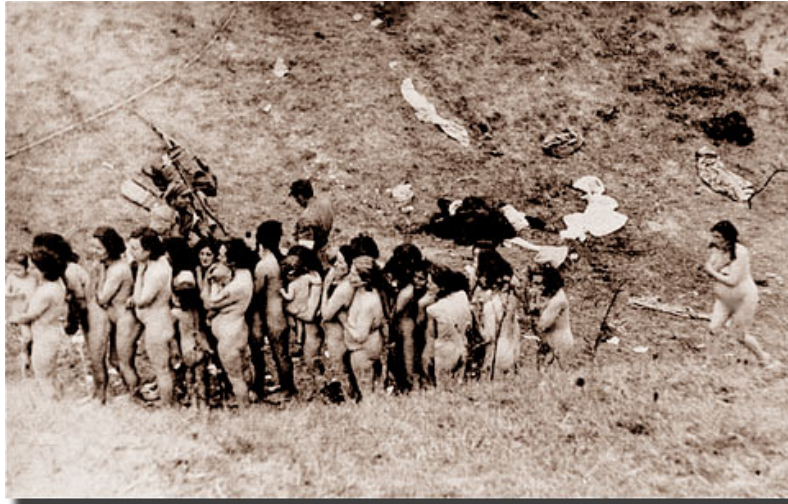
Figure 3. Women and Children before an execution by German soldiers, Mizocz, Rovno, Ukraine 14 October 1942 , photographed by Sergeant Hille of the German Gendarmerie, USHMM photograph no. W/S 17877; photograph used by Alain Resnais in Night and Fog (France, 1955) Public Domain.