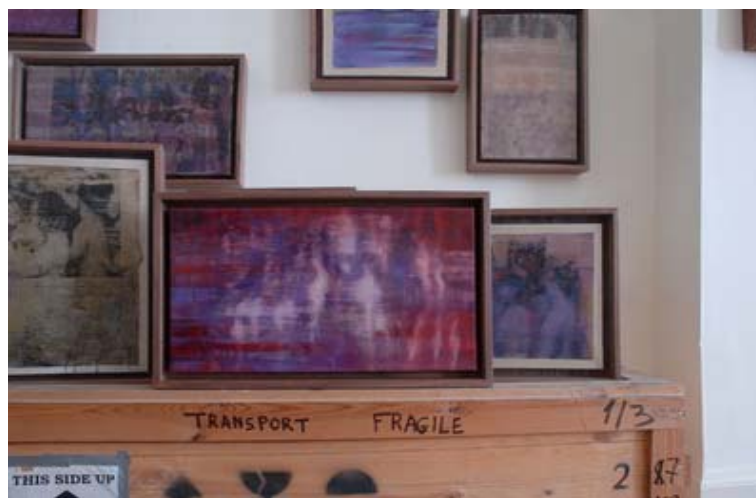
Figure 10. Detail of installation of Eurydice and No Title Yet paintings by Bracha L. Ettinger in the Freud Museum, London, June-July 2009. Courtesy of the artist.