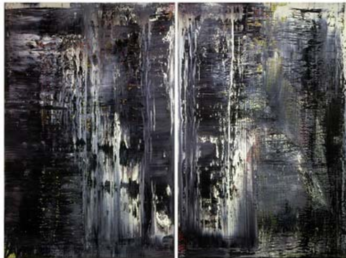
Figure 12. Gerhard Richter (b. 1932) November , 1989, oil on canvas, 320x400 cm, St. Louis Art Museum. Reproduced by kind permission of the artist.