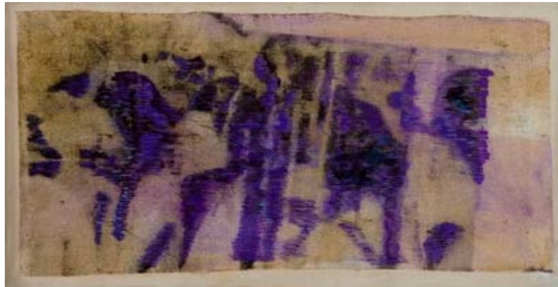
Figure 5. Bracha L. Ettinger, Eurydice n. 14 , 1994-98, oil and photocopied dust on paper mounted on canvas, 51.5x 20 cm. Courtesy of the artist.